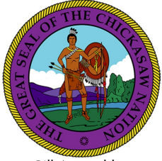
Bill Anoatubby Governor